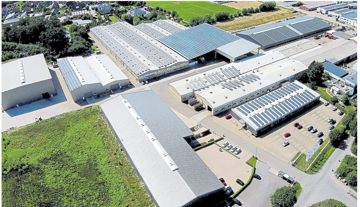
View of the 80,000 square metre premises of the HIMMEL Group on Venneweg.