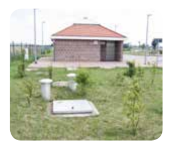
Pumping station on a motorway

Waste water and sewage are collected and transported without blocking by means of compressed air. With every pumping action oxygen is injected into the waste water which ensures that it remains aerobic. The whole pressure pipe is completely emptied by pneumatic flushing on a daily basis thus avoiding sedimentation and the formation of drain skin.