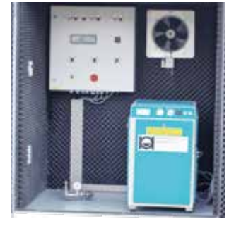
Cabinet with screw compressor and an integrated pump control