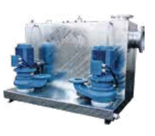
Type NSK 2D