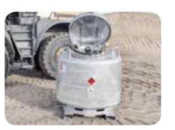
LT 1000 sets new standards

The fuel container licensed as IBC in accordance with traffic regulations may be carried without a permit to carry hazardous goods and entitles the user to carry out stationary operations and operations on construction sites.